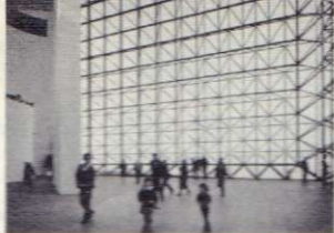
Cover: The John Fitzgerald Kennedy Library Columbia Point on Dorchester Bay, Boston, Massachusetts Architects: I. M. Pei & Partners