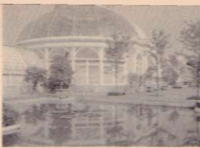
Cover: Enid A. Haupt Conservatory New York Botanical Garden Bronx, New York Architect: Edward Larrabee Barnes