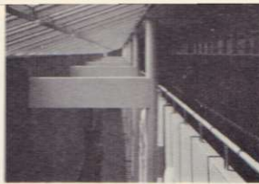
Cover: Thomas & Betts headquarters Raritan, New Jersey Architects: Gwathmey Siegel Architects