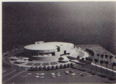
Wayne Thom Associates

The Pacific Museum of Flight in Seattle. The U.S. Air Force Energy Showcase Building in Sacramento. The West Clinical Services Building for the Henry Ford Hospital in Detroit. A Municipal Hall for Maple Ridge, British Columbia. The University of Nevada's 18,000-seat arena and Continuing Education facility. A "Crystal Pavilion" for Manhattan, and a corporate headquarters in Tulsa.