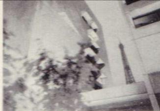
The new Australian Embassy Paris, France Architect: Harry Seidler & Associates