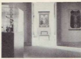
Cover: St. Louis Art Museum restoration St. Louis, Missouri Architects: Hardy Holzman Pfeiffer Associates