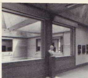
Cover: Yale Center for British Art New Haven, Connecticut Architects: Louis I. Kahn/Pellechia and Meyers