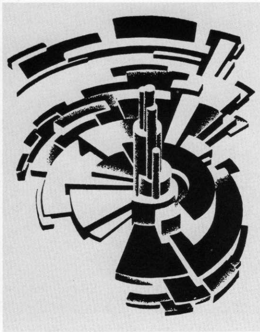
IA CHERNIKHOV, SECTORAL VOLUMES, c 1930