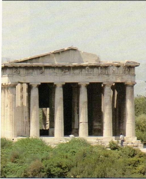
THESEION, ATHENS, 5TH CENTURY BC